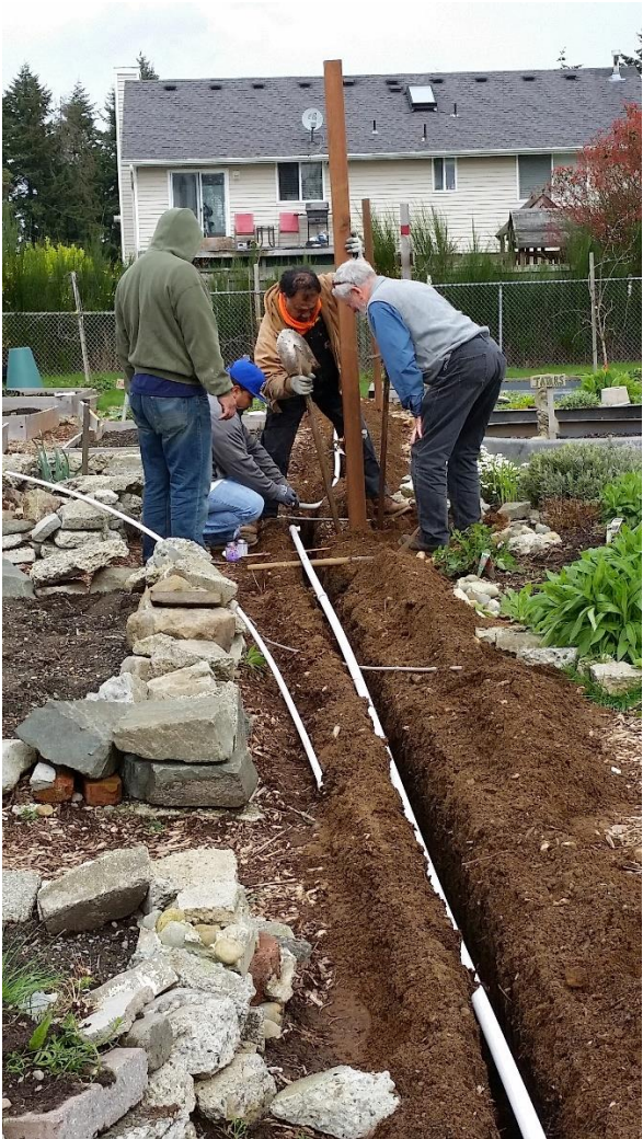
Irrigation System Being Installed

New features in the garden this year include over 20 additional fruit trees, a hummingbird garden, and an area for edible flowers. The summer program students started to install a walking path along the eastern side of the garden that will eventually encircle the community garden area. More perennial flowers were added to attract pollinators and additional signage was created by the students. Our hoses hand on very cool metal hose brackets created by the students at the Skills Center.