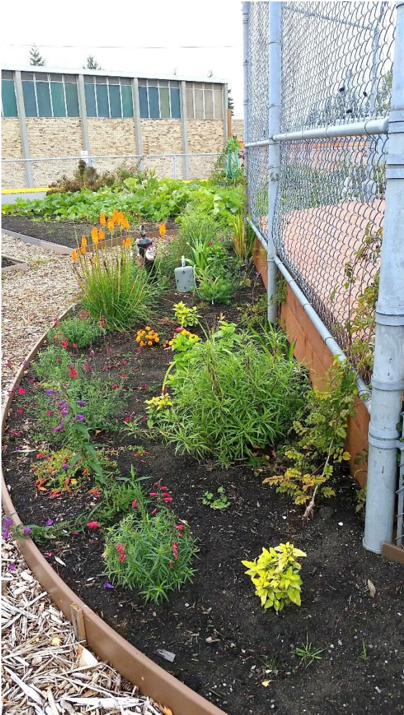
New Hummingbird Garden Area