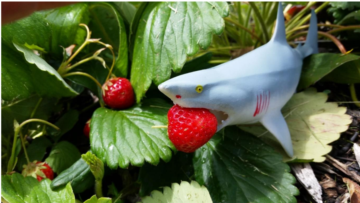
Example of one of our most popular Facebook posts, our mascot showing what was fresh that day.

Our Facebook page can be found here: https://www.facebook.com/theSharkGarden/