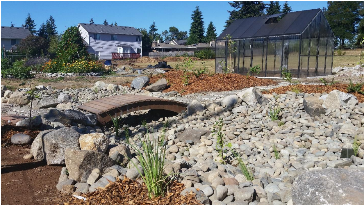
The new Rain Garden includes a foot bridge and a variety of native plants.

September 24 th 2016 was a particularly special day, in the Shark Garden, when 457 volunteers from NAIOP came to volunteer on the New Start campus. About a third of them worked in the garden area, serving around 914 hours! The NAIOP brought with them an estimated $164,000 worth of materials and equipment donations to the campus and around $55,000 of that was spent in the Shark Garden. Other parts of the school campus received improvements that included landscaping, painting, new signage, new picnic tables, and various other repairs. We are very grateful for all of these improvements. Photos and videos can be seen on our Facebook page from that day.