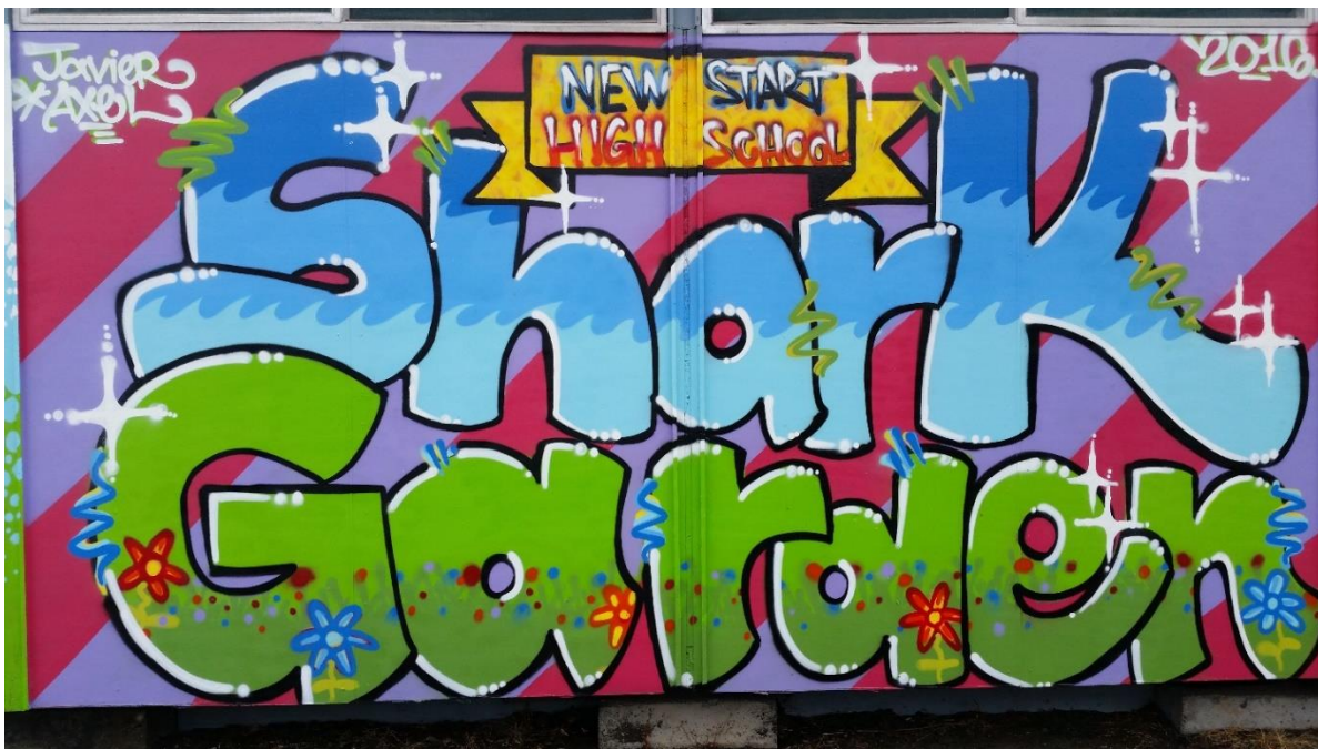
The new Shark Garden mural. This image will likely be the cover of our Thank You cards.

storage space. A gravel road was added to connect the western entrance to a new southern arbor gate entrance. Four large bed areas were prepared as public pea patches and currently the District is exploring potential partnership opportunities with the Burien Parks Department for this community area. Another landmark was reached when a new water meter was funded and installed, by the community, so that the garden will now have its own water supply. The $8,000 price tag for the water meter was split between the Highline School District and individual donors. The new 400 square foot demonstration rain garden was completed and planted with native plants. The greenhouse was moved from the high school courtyard over to a spot next to the rain garden. A Shark Garden mural was created by students on the school portable wall, facing the garden. The fence along the western side of the garden was also given a fresh coat of paint. All of these improvements have really started to give the garden an identity in the community.